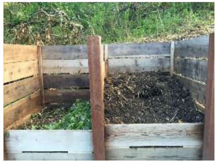
The home-built compost bin

An underground spring augments their watering system. Bob's efficient home-built compost bin resides outside the fence, ready to nourish the garden organically.